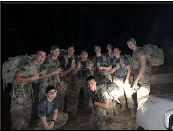
The 2020 Bataan Death March Team who unfortunately did not participate in the march, due to COVID

The Bearkat Battalion would like to thank each of our sponsors for making this opportunity possible for our cadets. This unique experience is a fantastic way for the cadets to honor those who have come before us and work together through adversity to become closer as a team.