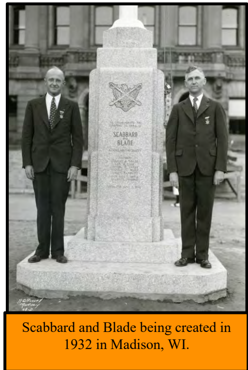
Scabbard and Blade being created in 1932 in Madison, WI.