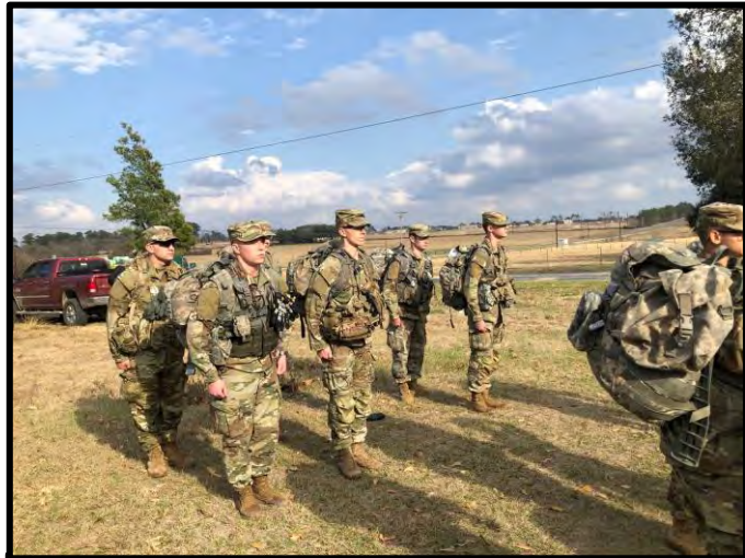
Ranger Company candidates at first formation for their Day Zero event.